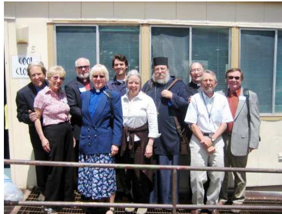
Interfaith Leadership Alliance members at the Grand Opening of Cool Closet

The ILA supports this mission with its broad membership of clergy representing many different faiths in Santa Fe..